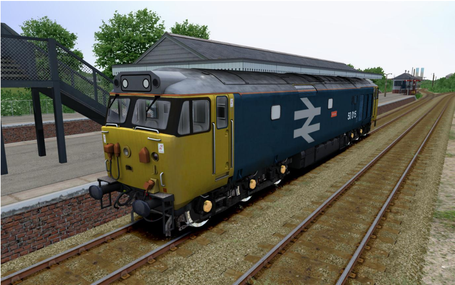
Class 50 Large Logo, large logo Black Roof and Blue Roof.