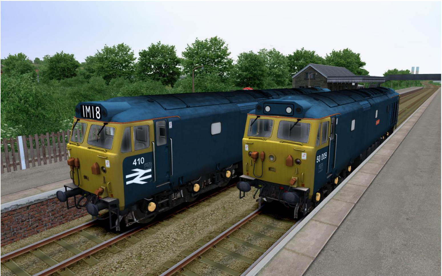
7. Left: Class 50 BR Blue Pre-Tops - Right: Class 50 BR Blue