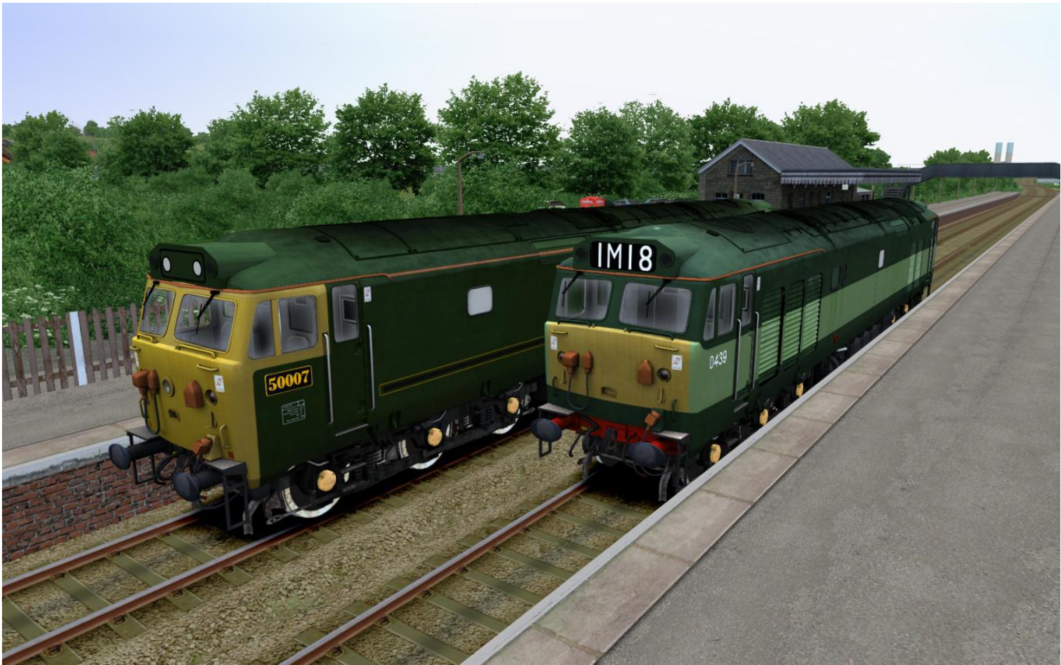
Left: Class 50 GWR - Right: Class 50 BR Dual Green