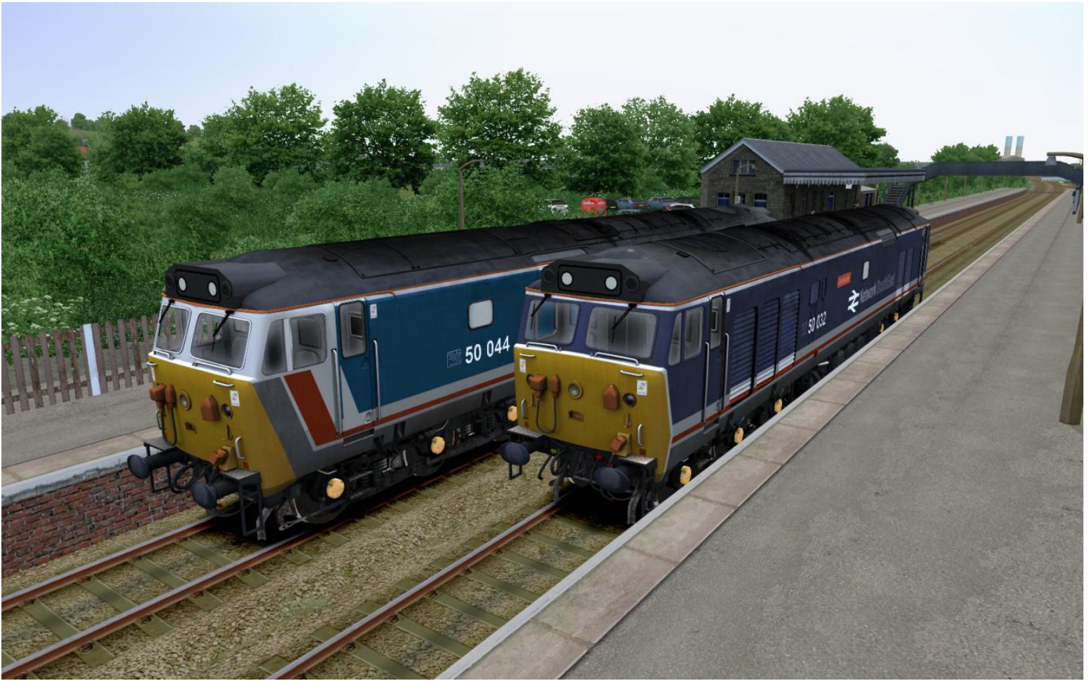
Left: Class 50 NSE Original – Right: Class 50 NSE Revised